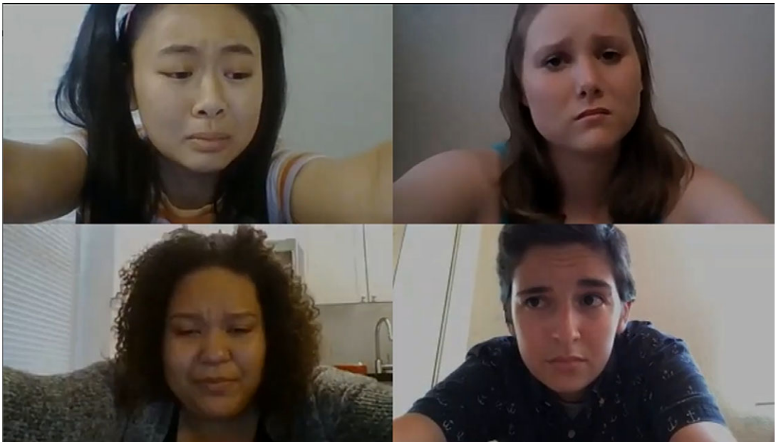
Figure 5. Corona Chicken (Part Two) . The family members stretch out their hands to embrace.

Jami Brandli's Pandemic Therapy (2020) belongs to the same collection, Alone, Together . 64 It reflects the hardships of lockdown and captures our longing for connection. Brandli introduces the play in these words: 'I wanted to explore how a young married couple could have very different reactions to sheltering-in-place for seventy days. I also wanted to add a touch of the absurd with the therapist, the person who is supposed to be the most centered . . . and it becomes clear she is not.' 65