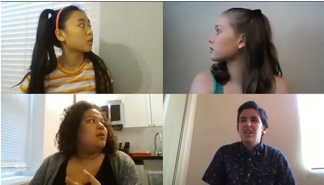
Figure 4. Corona Chicken (Part Two) . The characters' simultaneous response to the sudden break of a news broadcast.

Kirk expresses his pessimistic attitude, saying that they all will die like their brother Bertie. 'If the virus doesn't get us, then . . .' he begins, 59 but his mother interrupts him nervously and orders him to finish his assignment. The tense argument between her and Kirk is comprised of short utterances, interrupted with pauses and shouting. This play mirrors the common familial, social, and psychological troubles resulting from extended quarantine. People undergo terrible nervous pressure, feeling that their life is threatened by imminent danger. Studies suggest that children are more affected by quarantine restrictions during the pandemic because of boredom, restrictions on their social activities, and anxiety about losing a family member. 60 Moreover, 'greater aggressive, anxious, or rebellious behaviours exhibited by children may be results of spending too much time with adults at home and having to change their daily routines'. 61 These negative effects are cleverly portrayed in Grace's and Kirk's interactions and mother-son relationship.