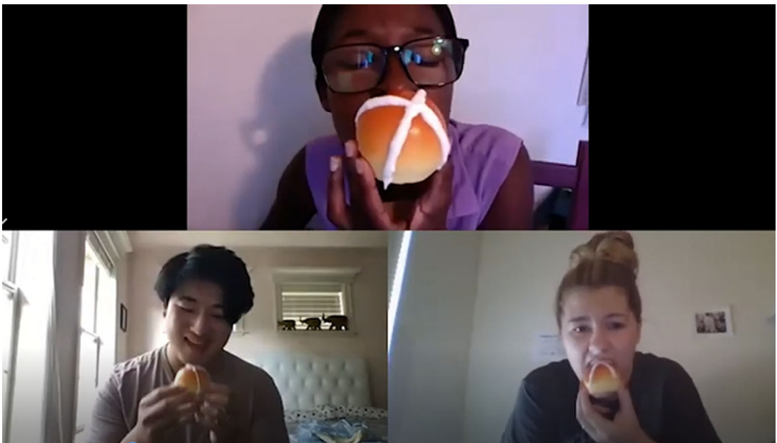
Figure 8. Pandemic Therapy. The three characters share the same food in an act of communal solidarity.

Because of the limits of the Zoom screen, performance allows a limited number of panellists/actors, and the increase of panellists reduces the size of their windows and the