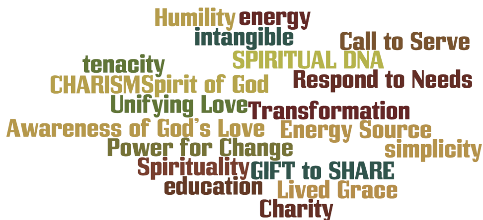
Figure 1. Charism

Charism is both a conceptual understanding of the call to ministry and a description of what ministry looks like on the ground.