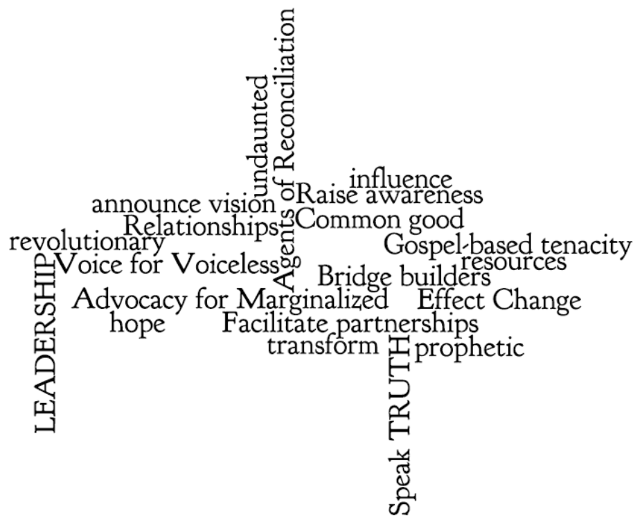
Figure 2. Leadership

. . . one person can't do everything and so you trust, you delegate, you encourage, you appreciate all the gifts of the people around you, recognizing that even though as the Administrator or whatever it is, that your job is to encourage other people . . . your leadership is really encouraging the gifts you see in other people and bringing that forth in them . . .